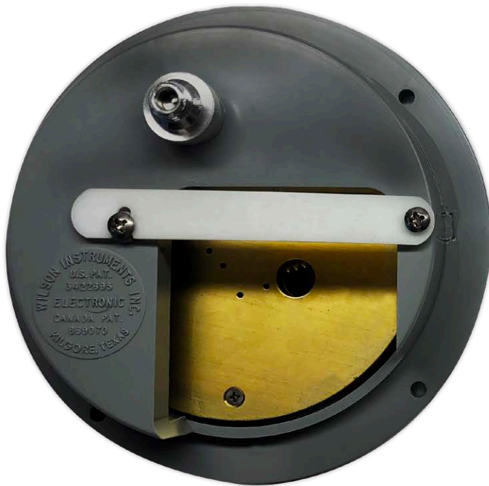
Mounting Bracket / Drive

Wilson Chart drives are designed to meet the high demands of the Oil and Gas market using quartz movement for accuracy and reliability. The “movement-only” feature allows the well tender to simply snap in a new motor when the old one comes to its normal end of life. This method removes the hassle of a field replacement.