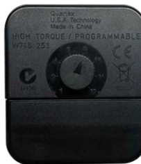
32028344 (Replacement Movement Only)