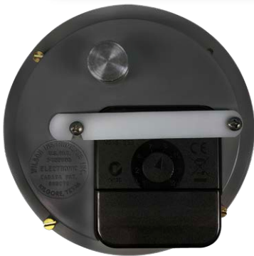
32028312 (Complete Kit)